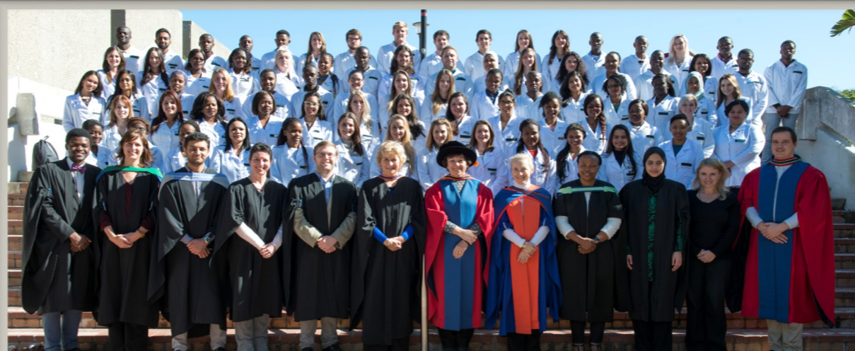
GRADUATE CLASS of 2016